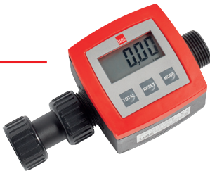
Flow meter TR90