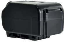
Replaceable battery with Li-Ion technology