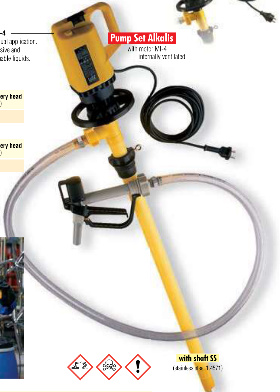
Pump Set Alkalis

with motor MA II 3 externally ventilated