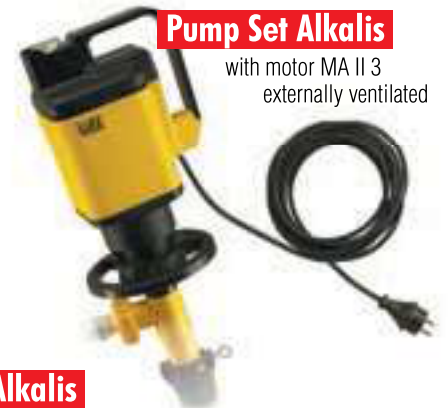
Pump Set Alkalis

with motor MA II 3 externally ventilated